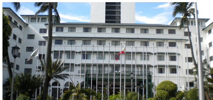
The elegant Manila Hotel located near the Rizal Park, a potential venue for future international alumni reunion activities in the Philippines.