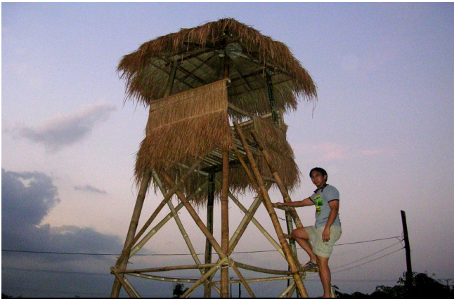
Dennis Galinato climbing the reconstructed POW camp guard tower.