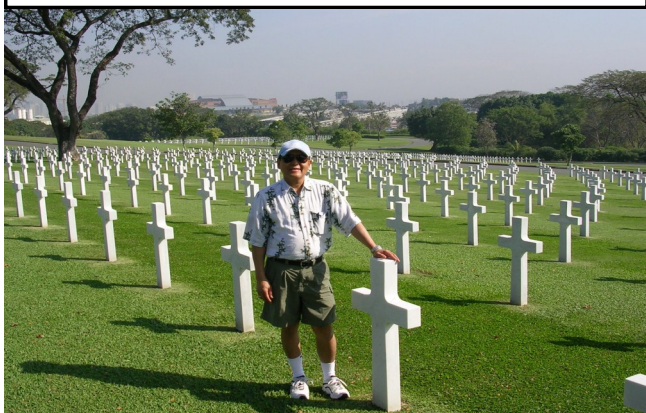
American Memorial Cemetery near Fort Bonifacio.